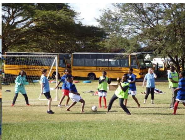
Match with Kibagare Ladies