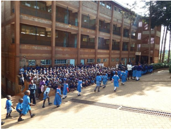
Kibagare Good News Centre