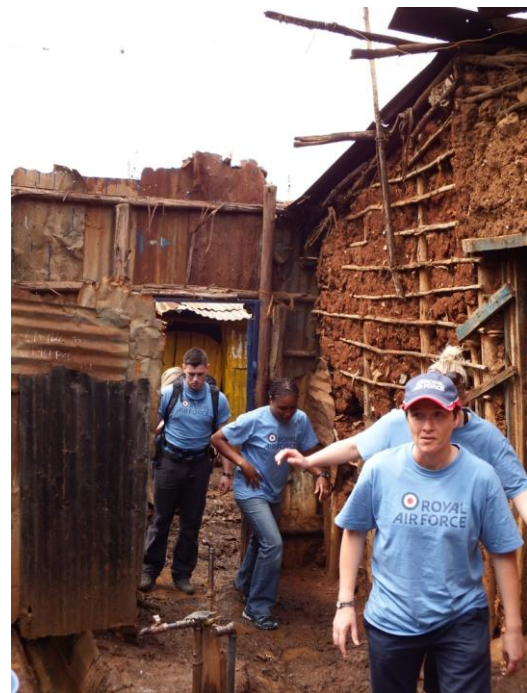
Team in Kibera