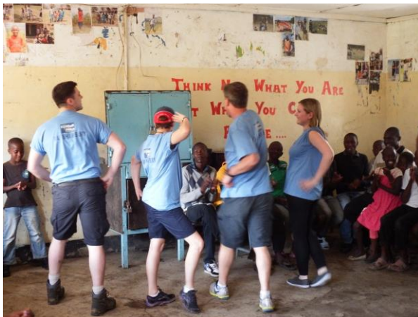
Team entertaining at Sanchat

http://www.saidia-gilgil.org.uk/index.shtml