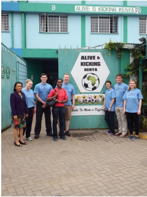
Alive and Kicking Workshop, Nairobi