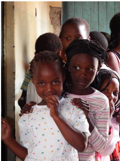
Children at Sanchat Re-Start Centre

http://www.woodard.co.uk/woodardkenyaschool.htm