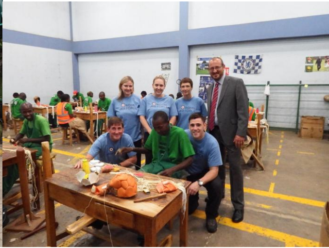
Alive and Kicking in the workshop

The party then travelled across Nairobi to the Braeburn Garden Estate School, their base for the week.