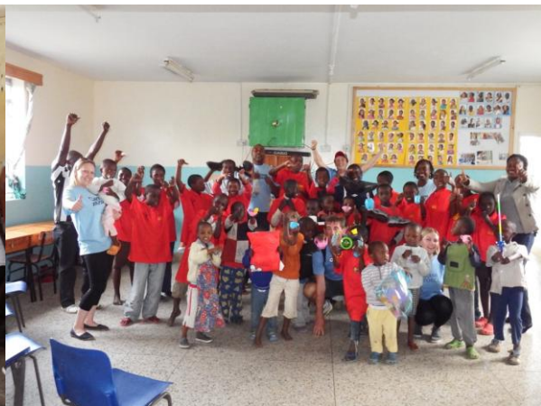
Saidia Children's Home

The party spent the night at the superb Sunbird Lodge overlooking Lake Elementaita with its flamingos before traveling back to Nairobi via the look out over the Great Rift Valley. They arrived back at Braeburn in time to watch the Braeburn 6 a side football tournament and hand out some England and Manchester United shirts to some of the players. During the afternoon many other charities visited Braeburn to receive kits from the Appeal.