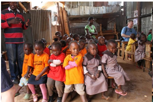
Pastor Amos Okolo School, Kibagare

https://www.facebook.com/KibagareAcademyOfTheKibagareSlums/info