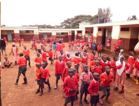
Chelata Primary School